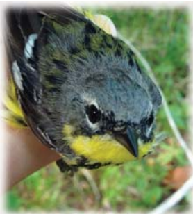
Magnolia Warbler - 1st confirmed breeding record for MABO in 2014!

This season, our seventh, will be much like our last - heavily focused on our ongoing Species at Risk studies (Cerulean Warbler, Red-headed Woodpecker, Louisiana Waterthrush) and monitoring using Point Count and Mark-recapture (MAPS) techniques. Without exaggeration, it's safe to say there will be oodles and oodles of Point Counts again in 2015! As always, we'll also be nest searching, atlasing and documenting encounters with rare flora and fauna species of conservation concern.