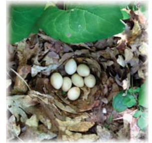
Ruffed Grouse nest, June 2014

This season, our seventh, will be much like our last - heavily focused on our ongoing Species at Risk studies (Cerulean Warbler, Red-headed Woodpecker, Louisiana Waterthrush) and monitoring using Point Count and Mark-recapture (MAPS) techniques. Without exaggeration, it's safe to say there will be oodles and oodles of Point Counts again in 2015! As always, we'll also be nest searching, atlasing and documenting encounters with rare flora and fauna species of conservation concern.